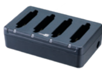
4-slot Battery Charger