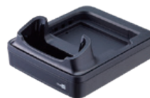
Charging and Communication Cradle